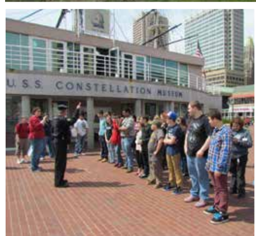
ABOVE: Deaf and hard of hearing students from the Lincoln Intermediate Unit enjoy the view from Fort McHenry in Baltimore, thanks to funding from the Braithwaite Trust. LEFT: Deaf and hard of hearing students from the Lincoln Intermediate Unit visit the U.S.S. Constellation Museum in Baltimore through a generous grant from the Braithwaite Trust.