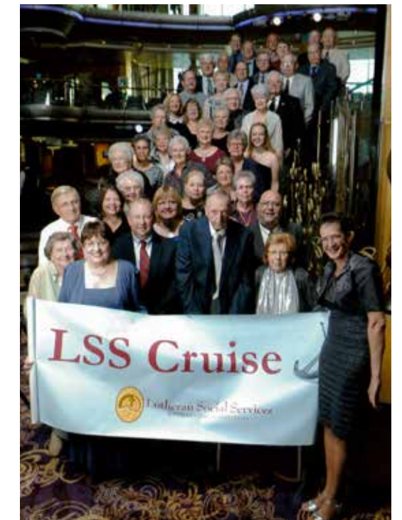
Cruisers gather on the "Grandeur of the Seas."

A group of 59 cruisers sailed on the Bermuda cruise from Sept. 26 - Oct. 2. Travel Time Travel/Bailey Travel coordinated the "Cruise for a Cause" aboard Royal Caribbean's "Grandeur of the Seas." The six-night cruise departed from Baltimore Pier and docked at King's Wharf where participants enjoyed the island's breathtaking pink sand beaches and quaint colonial charm. The trip raised over $9,000 to provide care for Senior Living communities residents who have outlived their resources and can no longer afford the cost of their care. SpiriTrust Lutheran has received more than $30,000 over four years through fundraising cruises through the travel agency.