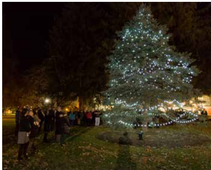
Family and friends of those memorialized on the Hospice Tree of Light gather for the tree lighting ceremony on the Wilson College campus.

Hundreds of donors chose a special way to make a donation to hospice this winter by purchasing a light on our Home Care & Hospice Tree of Light. More than $13,000 was raised to provide hospice care for individuals who cannot pay the full cost of the care they need. This was the third year for the Tree of Light, which included two locations: The Lutheran Theological Seminary at Gettysburg on Nov. 30 and Wilson College in Chambersburg on Dec. 7. Both tree-lighting ceremonies events were well-attended and reminded us that the light of our loved ones still shines and the darkness has not overcome it.