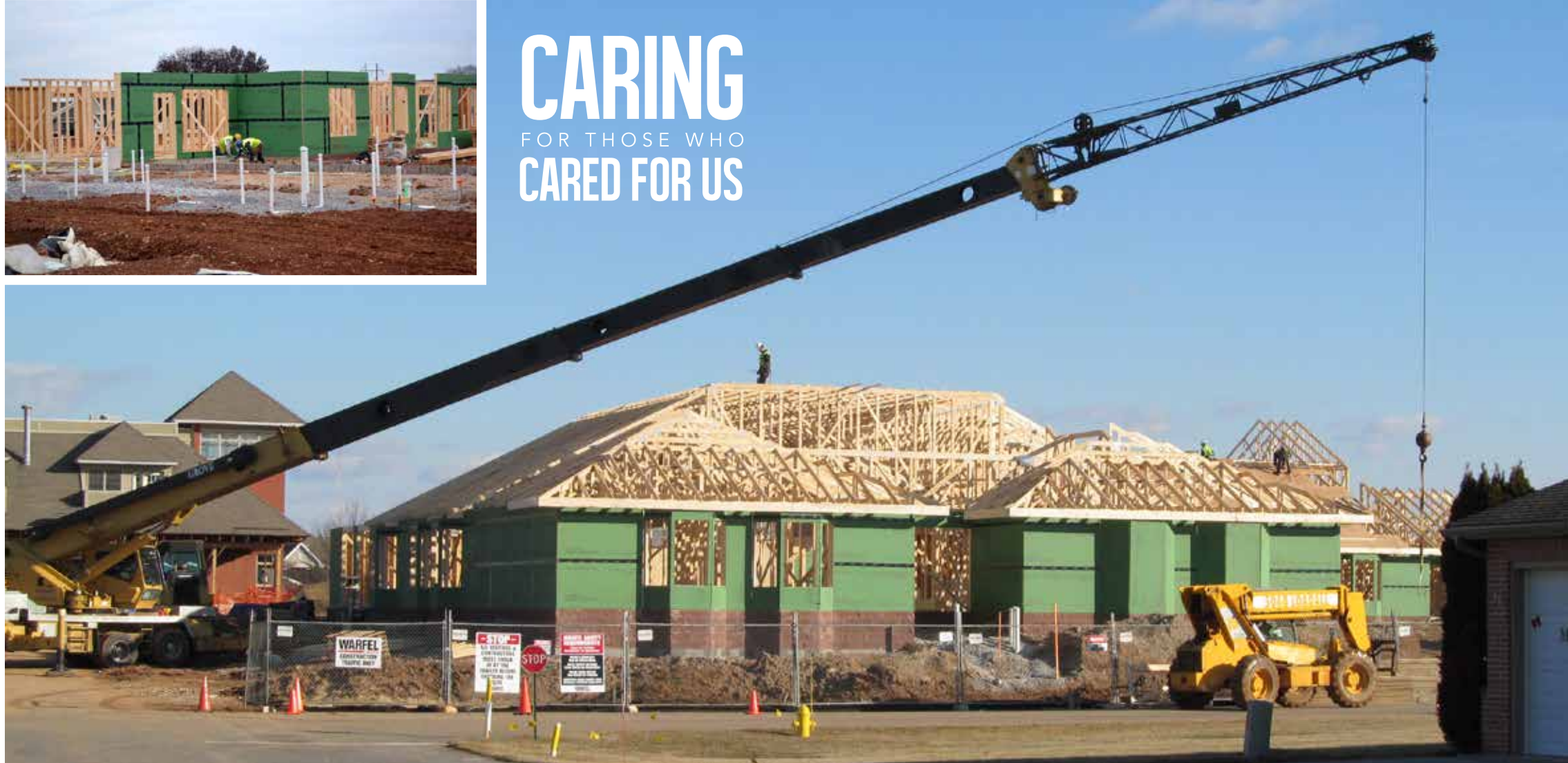
MAIN: Capital Campaign donations at work as construction begins on SpiriTrust Lutheran™, The Village at Sprenkle Drive expansion project. TOP LEFT: Construction employees spread concrete at the site of the new Assisted Living residence at SpiriTrust Lutheran, The Village at Sprenkle Drive.

For the first time in many years, we conducted a $4.5 million fundraising initiative, Caring For Those Who Cared For Us , The Campaign for the Greater York Region, to raise necessary funds to support construction of Assisted Living and Assisted Living Memory Care residences, in addition to the expansion of the Glatfelter Community Center, at SpiriTrust Lutheran, The Village at Sprenkle Drive.