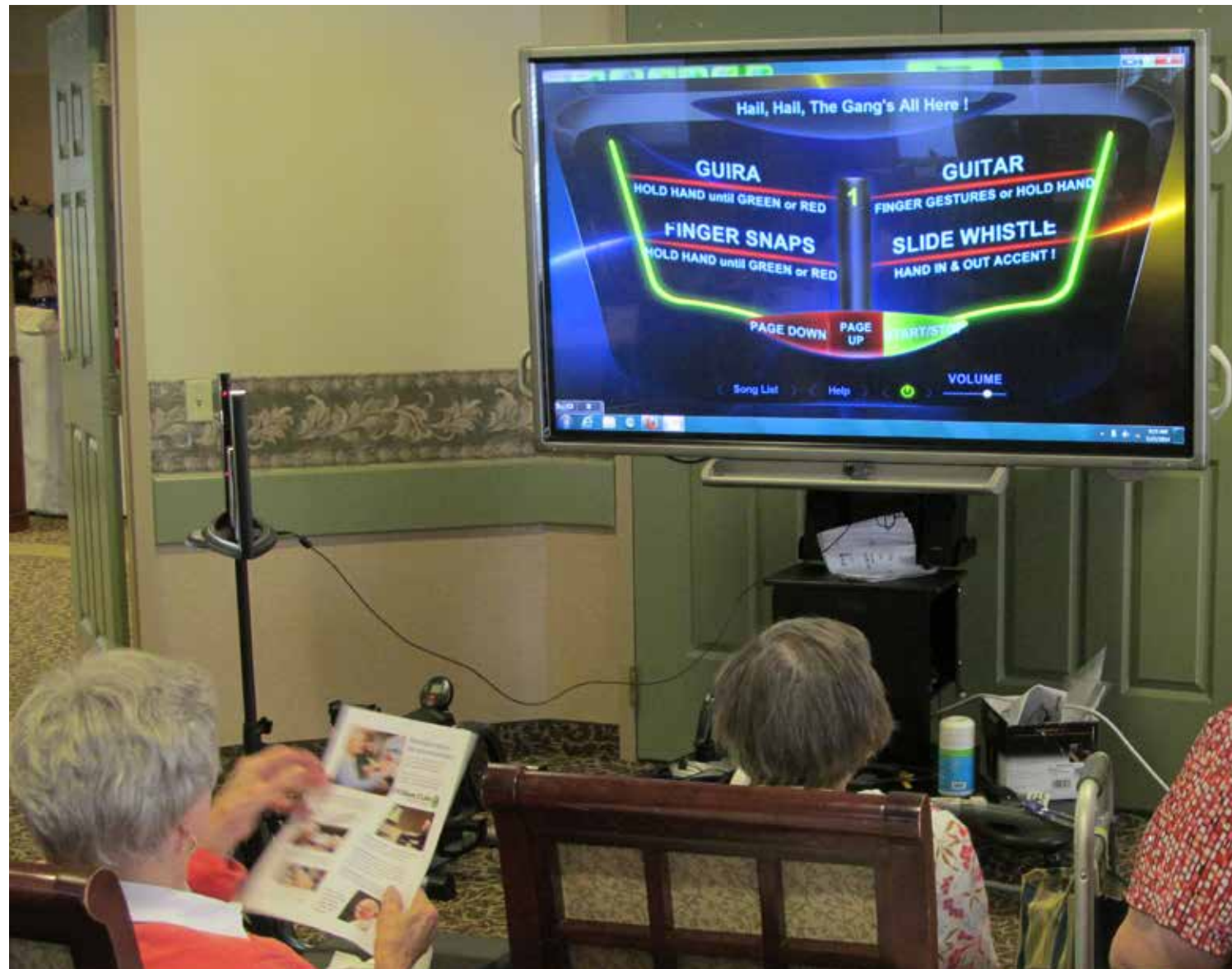
The Village at Utz Terrace residents and staff try out the musical instrument feature of the It's Never 2 Late system at the May demonstration