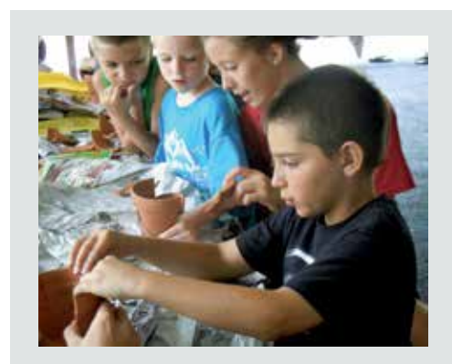
The cracked pot project at Camp Evergreen showed the children that, although their lives are very changed, their lives can be put back together.