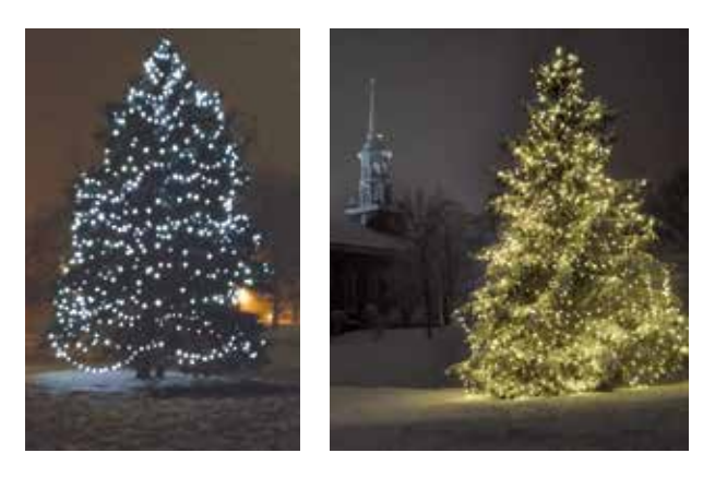
LEFT: Many thanks to the Wilson College administration who partnered with us and allowed us to use a tree on their grounds for the Tree of Light in Chambersburg. RIGHT: The Lutheran Theological Seminary at Gettysburg once again provided a tree on their campus for the Tree of Light in Gettysburg.

Hundreds of people dedicated lights on our Hospice Tree of Light to honor loved ones, raising almost $11,000 to provide hospice care for individuals who cannot pay the full cost of their care. In our second year, we added a second tree to the Hospice Tree of Light tribute. The second tree is located on the campus of Wilson College in Chambersburg. A snowstorm kept the crowd small the evening it was lit for the first time on December 8, but those present watched in awe as the lights illuminated the silent, snowy night with a message of remembrance. We also once again lit the tree on the grounds of The Lutheran Theological Seminary at Gettysburg at a lovely service on December 1.